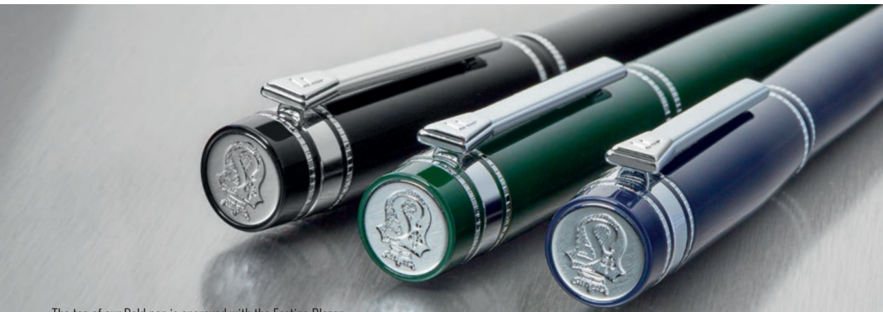
The top of our Bold pen is engraved with the Festina Blazon, a design element that is present throughout our existing writing collection.