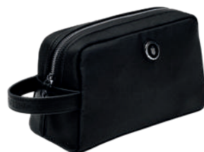
4. FTC426A Button Black Dressing-case