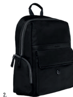
2. FTP426A Button Black Backpack

The Button bag line is made of Vegan leather (PU) and Nylon. Bags are delivered in a FESTINA Nylon bag