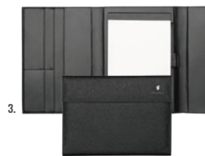
1. FPBM187A Set Chronobike folder A5 and Chronobike Classic ballpoint pen