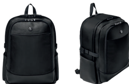
FTX426A Button Black Backpack weekend

The Button bag line is made of Vegan leather (PU) and Nylon. Bags are delivered in a FESTINA Nylon bag