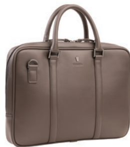
2. FTL223Z Classicals Camel Laptop bag