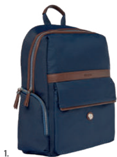
1. FTP426N Button Navy and Brown Backpack