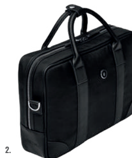
2. FTD426A Button Black Document bag

The Button bag line is made of Vegan leather (PU) and Nylon. Bags are delivered in a FESTINA Nylon bag