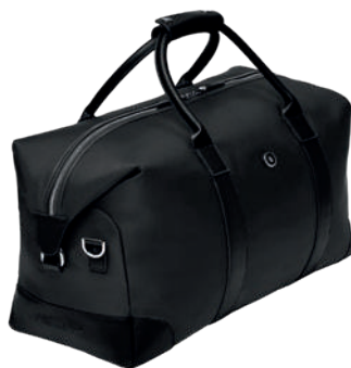
1. FTB426N Button Navy and Brown Travel bag