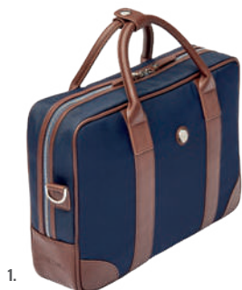
1. FTD426N Button Navy and Brown Document bag